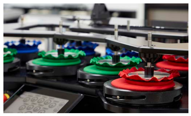
To ensure quality, many of the fabric types have undergone a thorough course of testing, such as wear tests, tear strength tests and break tests. High quality is at the core of MASCOT's DNA. MASCOT's slogan and consistent work method has always been TESTED TO WORK.

MASCOT only offers products that have been tested for long-term use. This applies to everything from fabric and reinforced seams to extra reinforcement in areas that are particularly subjected to wear and tear. We produce clothes in our own factories and can therefore guarantee 100% quality control. All this means that MASCOT's products last a long time. And this has a major impact on the sustainable balance sheet.