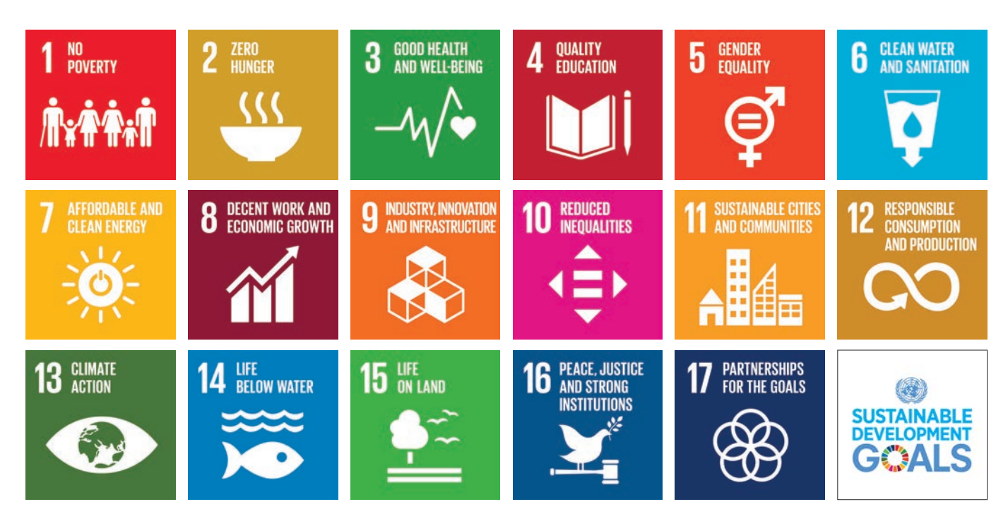
See more about how we work with the UN's Sustainable Development Goals in the relevant section on our website: www.mascotworkwear.com/en/mascot-and-the-qlobal-qoals