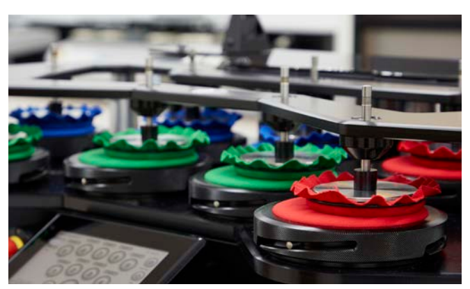
To ensure quality, many of the fabric types have undergone a thorough course of testing, such as wear tests, tear strength tests and break tests. High quality is at the core of MASCOT's DNA. MASCOT's slogan and consistent work method has always been TESTED TO WORK.

MASCOT only offers products that have been tested for long-term use. This applies to everything from fabric and reinforced seams to extra reinforcement in areas that are particularly subjected to wear and tear. We produce clothes in our own factories and can therefore guarantee 100% quality control. All this means that MASCOT's products last a long time. And this has a major impact on the sustainable balance sheet.